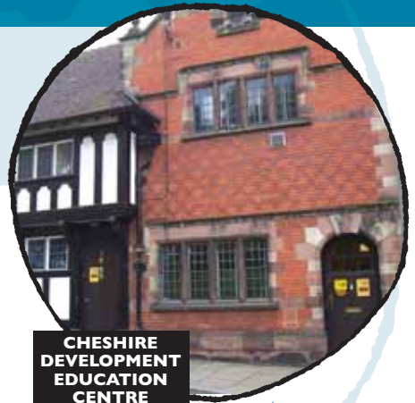
CHESHIRE DEVELOPMENT EDUCATION CENTRE

Please note – this directory has been compiled as a guide only and CDEC cannot guarantee the quality or availability of the services listed. Information on charges and availability can be found by contacting the organisations directly.